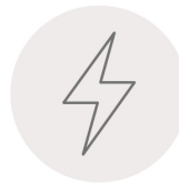
do great things, fast