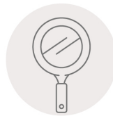
be real (with yourself and others)